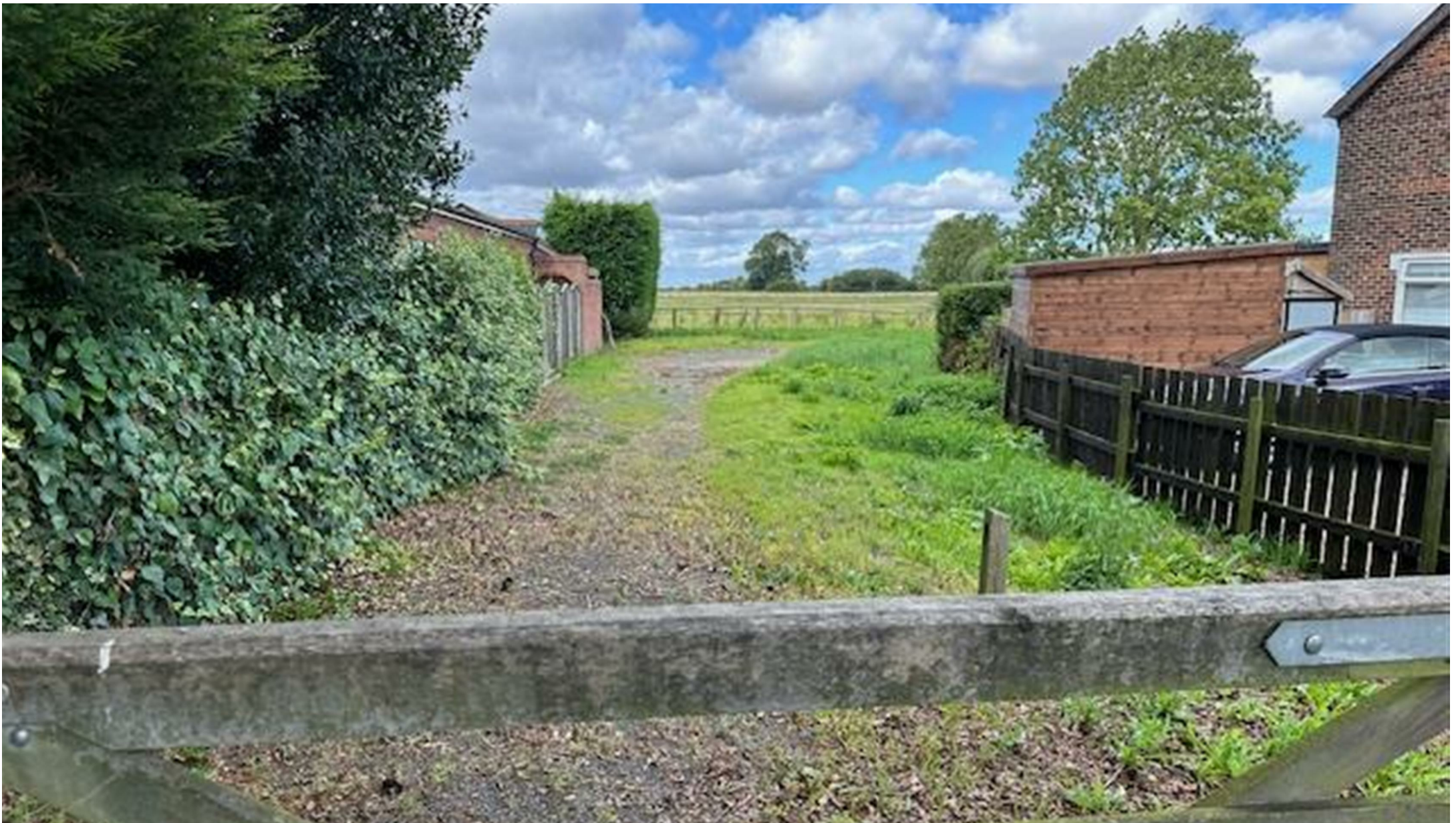
Land, Crowle Road, Eastoft, DN17 4PH £1