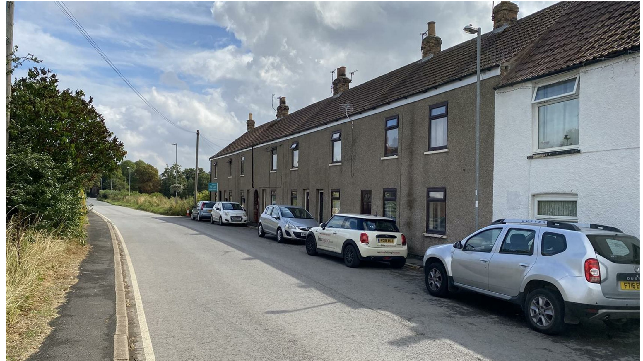
4, Anchor Row, Whitgift, Goole, DN14 8HJ £495 PCM