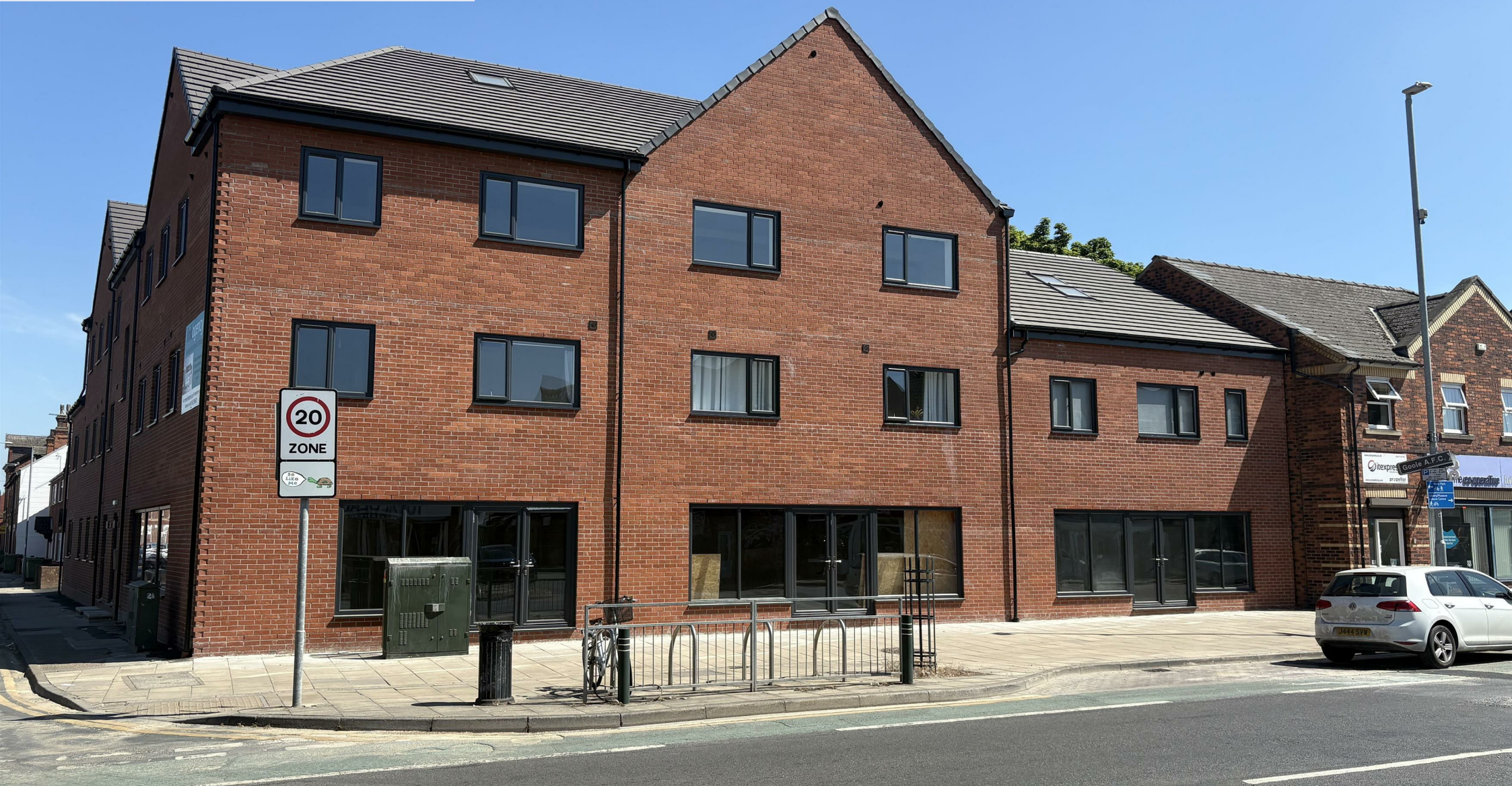
Carlton Apartments, Goole, DN14 6DG