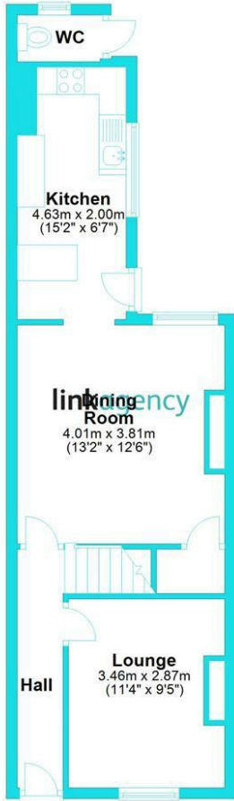
Ground Floor Approx. 43.2 sq. metres (465.1 sq. feet)