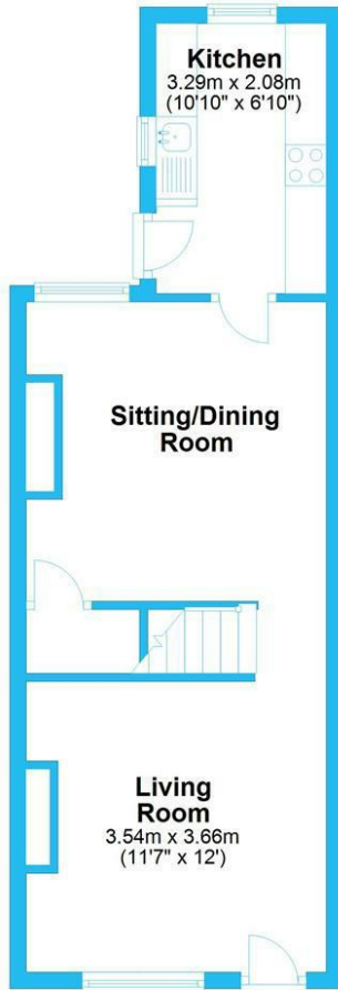
Ground Floor Approx. 37.0 sq. metres (397.8 sq. feet)