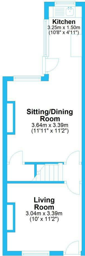
Ground Floor Approx. 30.9 sq. metres (333.1 sq. feet)