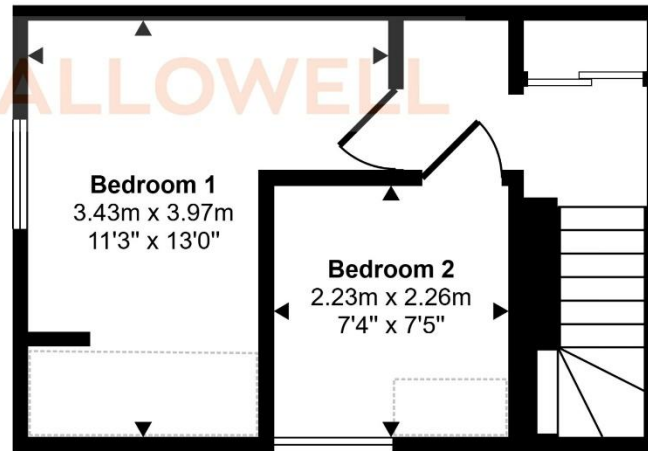
First Floor Approx 23 sq m / 252 sq ft