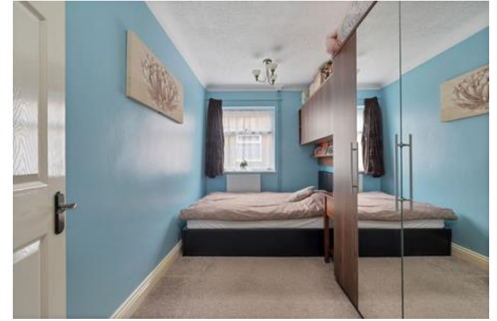
Bedroom Four 11'6" x 9'0" (3.5m x 2.7m)