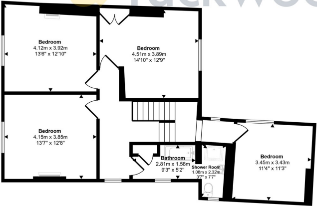
First Floor Approx 84 sq m / 908 sq ft