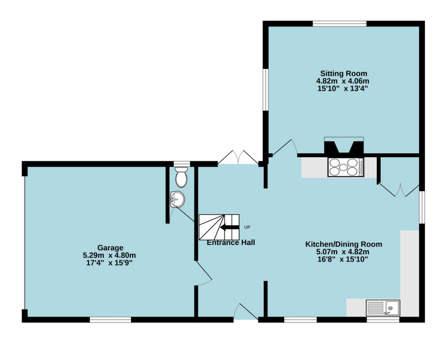
Ground Floor 79.1 sq.m. (852 sq.ft.) approx.