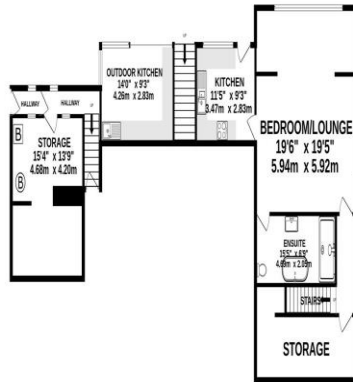
BASEMENT 1222 sq.ft. (113.5 sq.m.) approx.