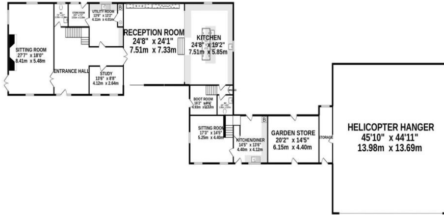
GROUND FLOOR 5360 sq.ft. (498.0 sq.m.) approx.