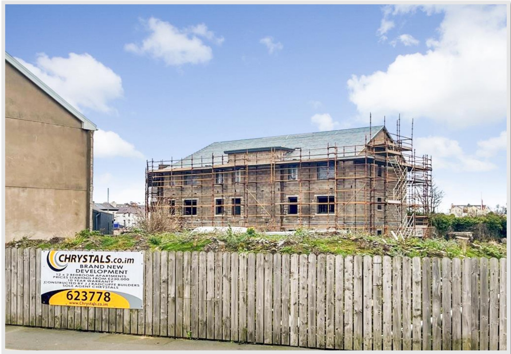
Phase I Forest View Apartments, Bowring Road, Ramsey, IM8 2LQ