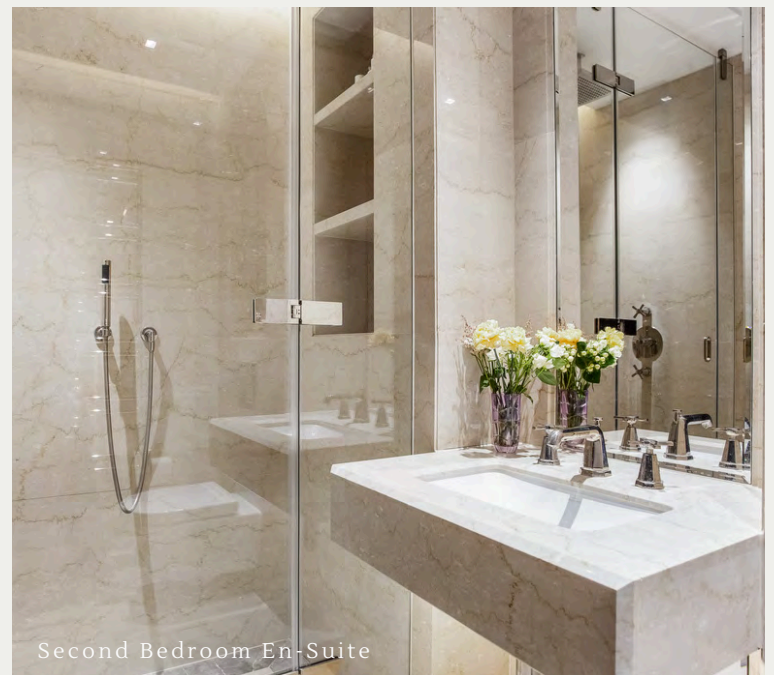
Second Bedroom En-Suite