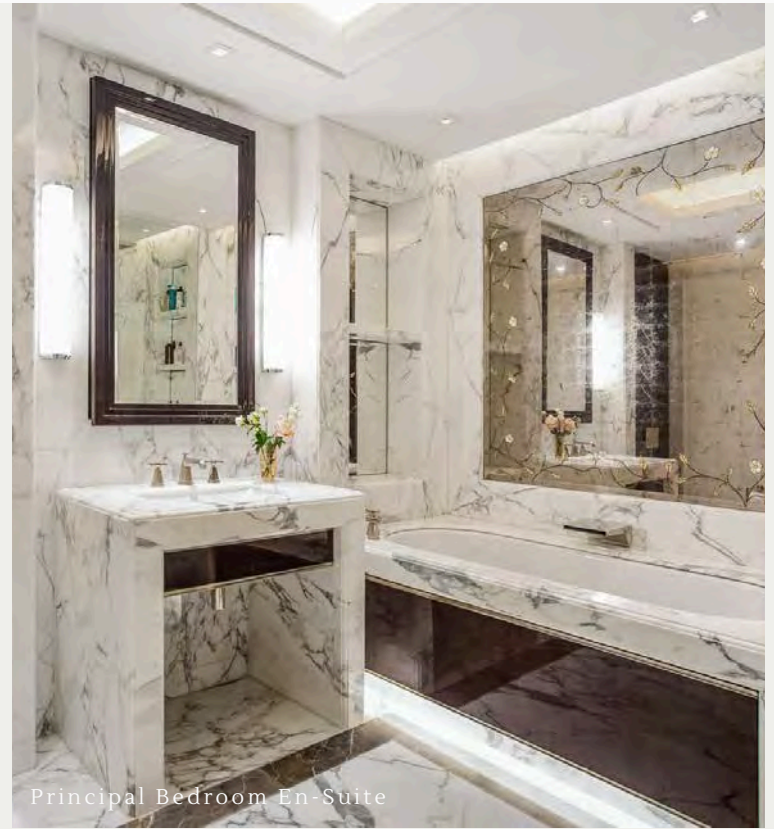
Principal Bedroom En-Suite