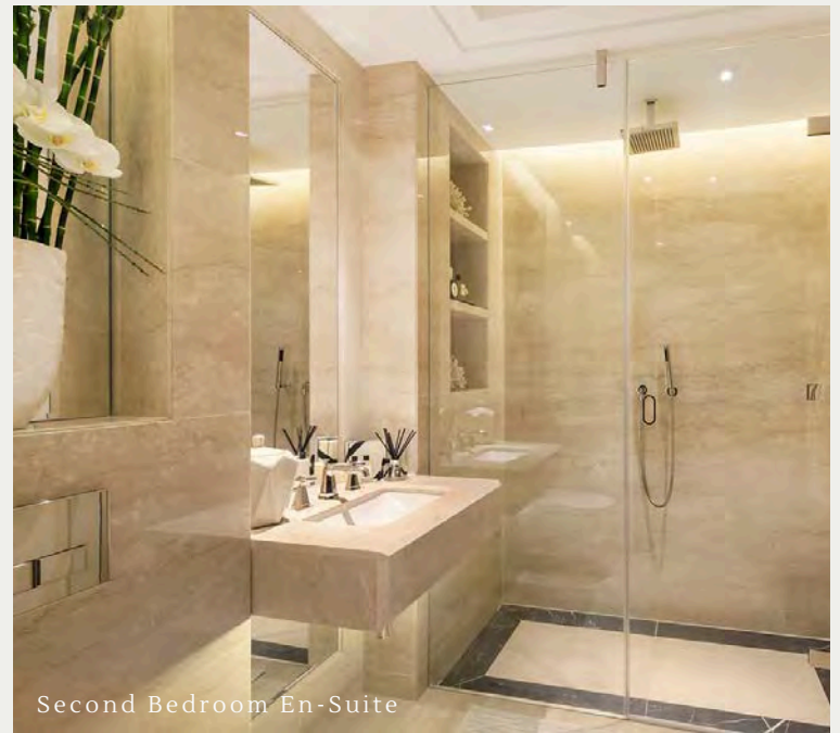
Second Bedroom En-Suite