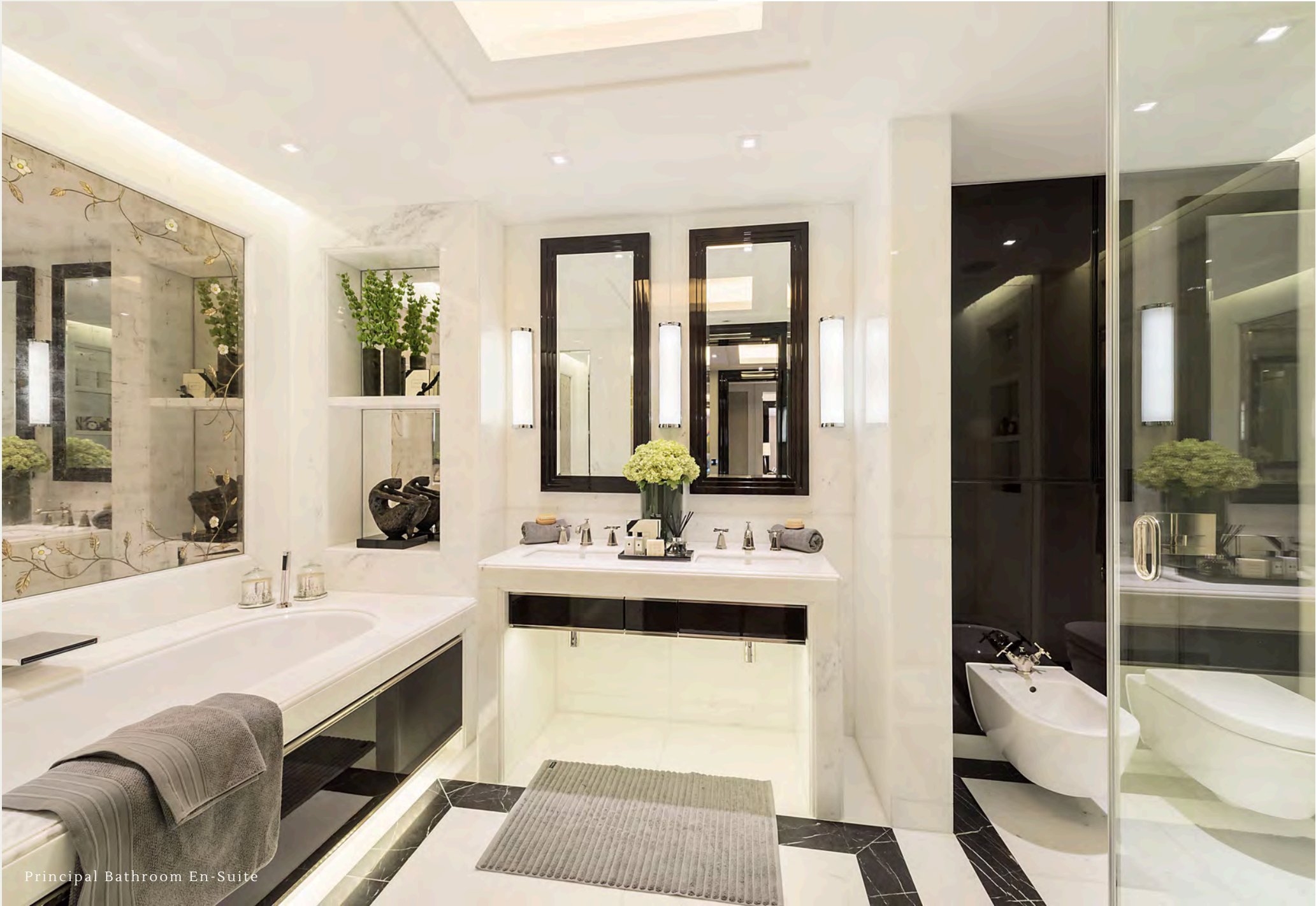
Principal Bathroom En-Suite