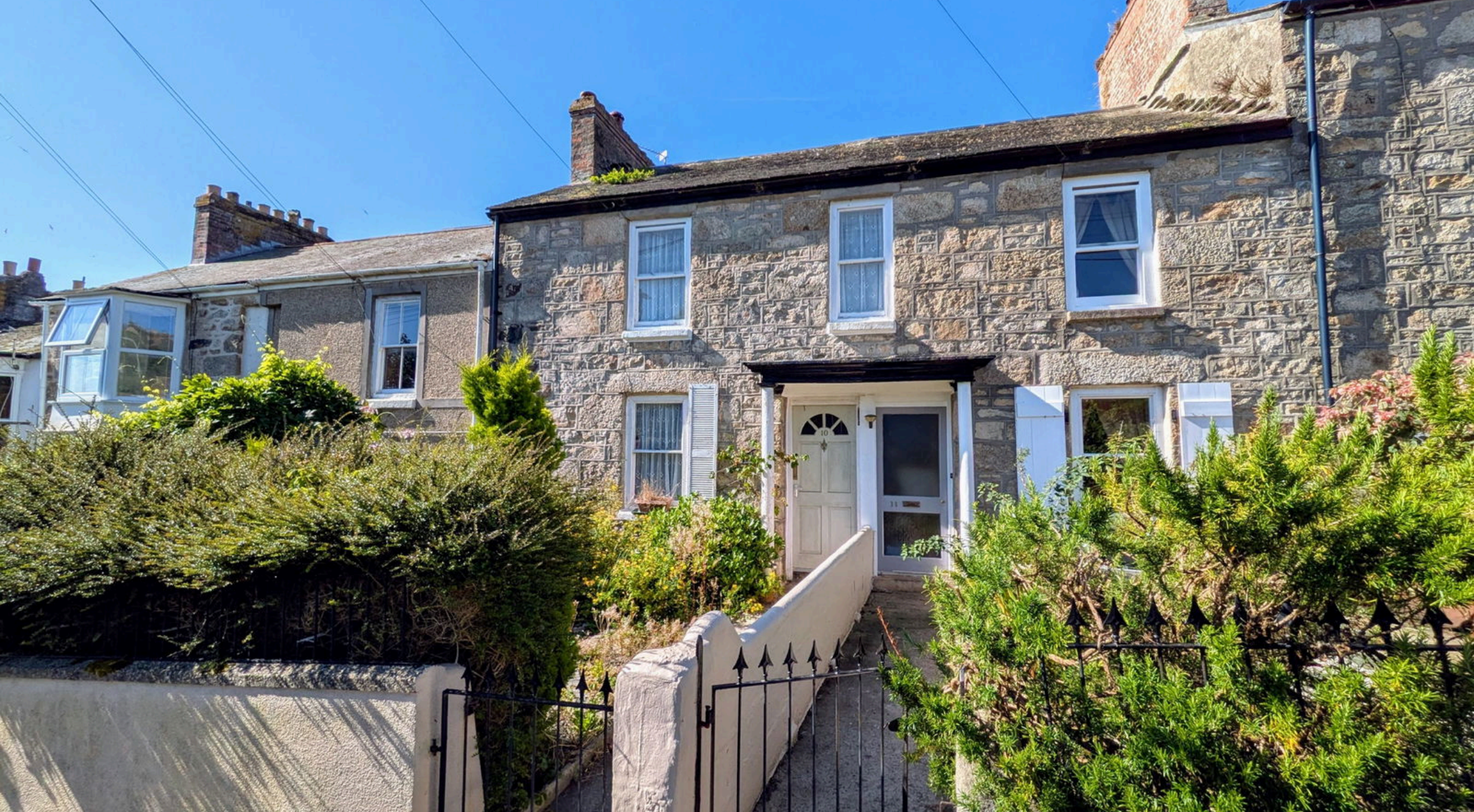
Leskinnick Terrace, Penzance TR18