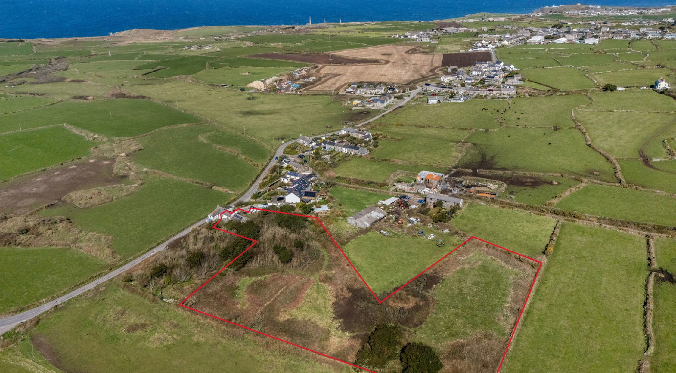
Falmouth Place, St Just TR19