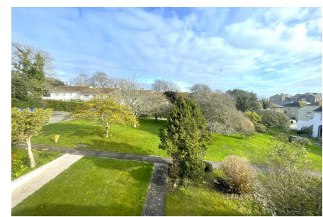
A three bedroom mid-terrace property that is located within this popular residential area of Penzance.