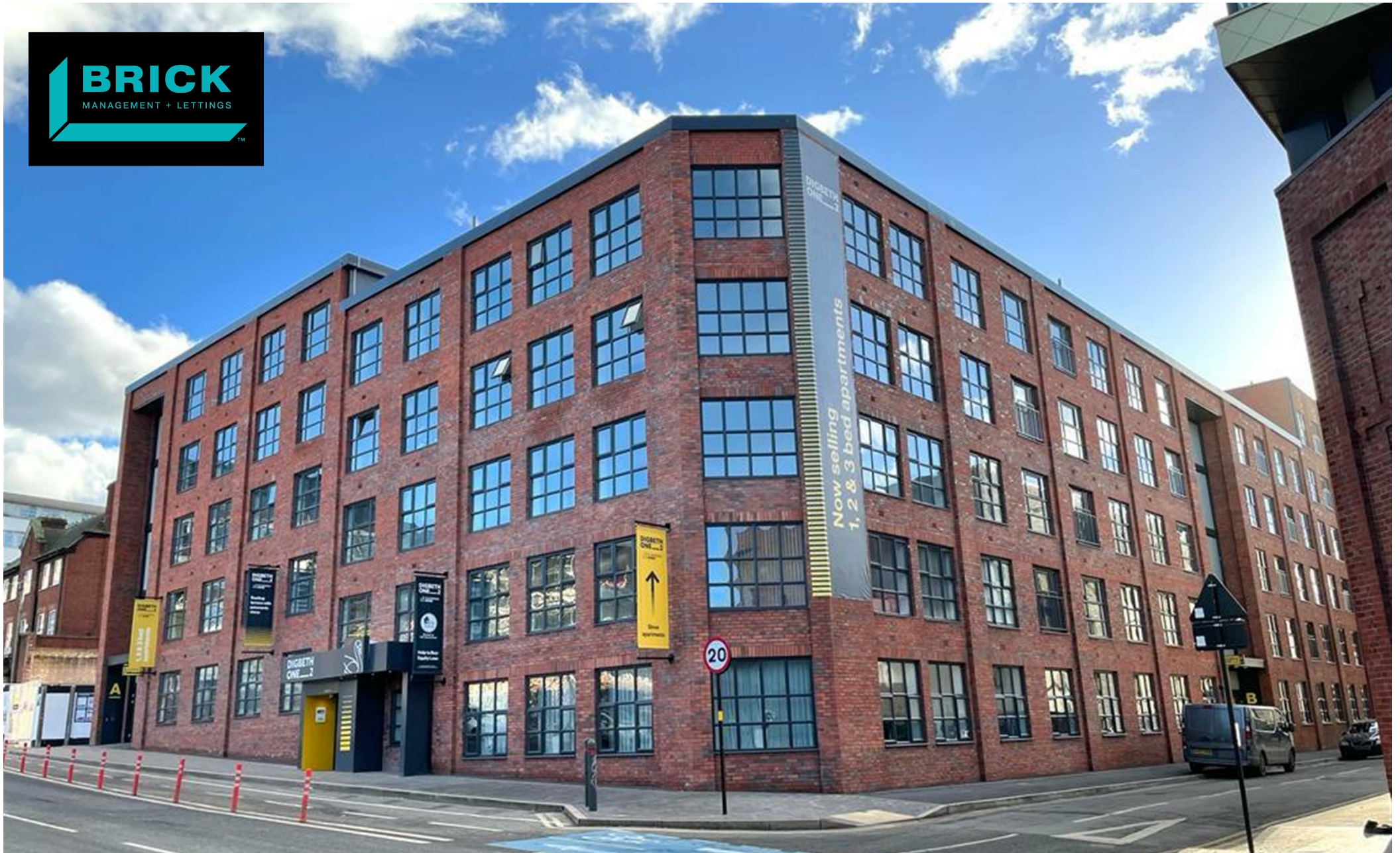
236 Digbeth Square 193 Cheapside, Birmingham, B12 0QF £995 Per month