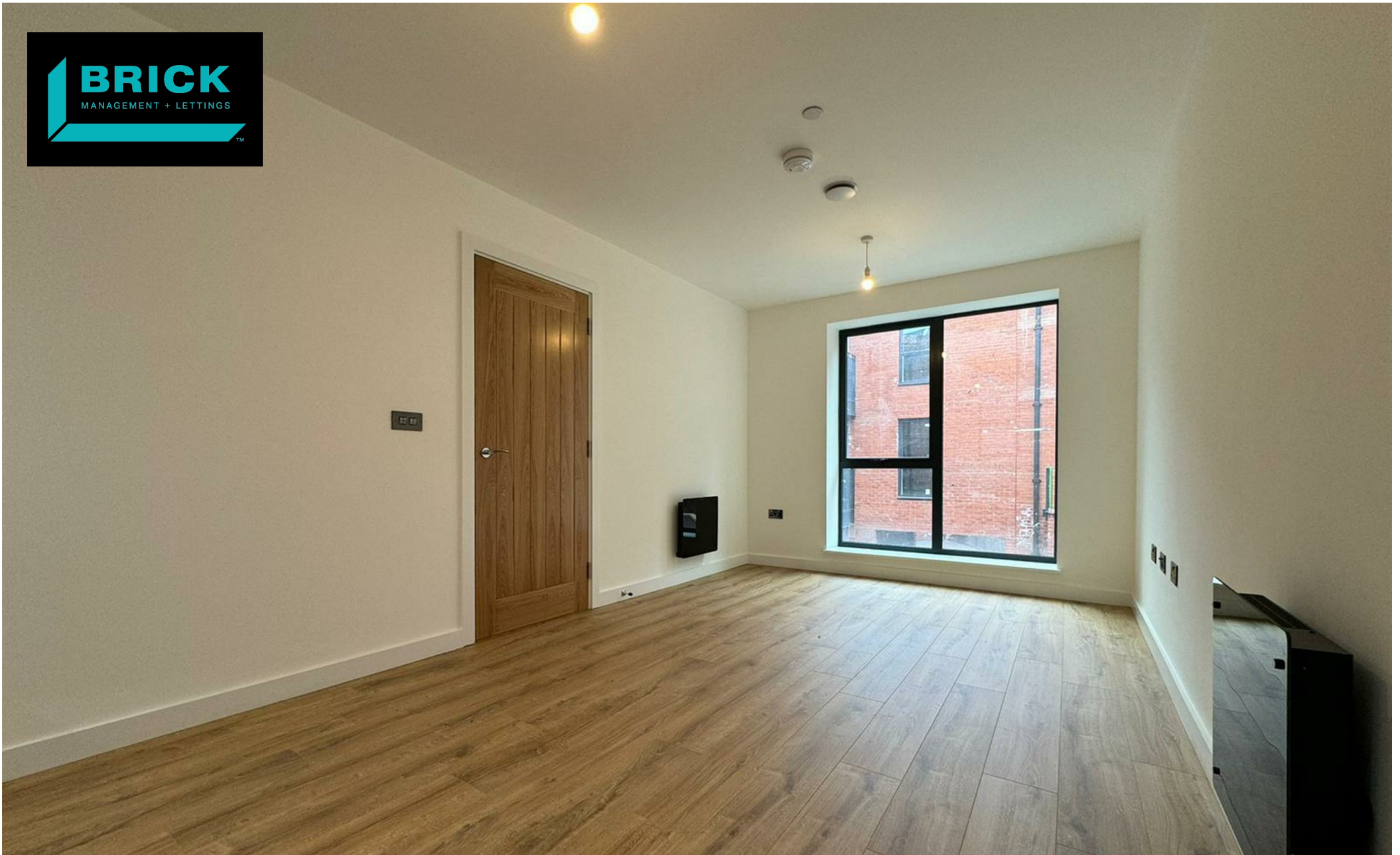
Apartment 4 6 Camden Drive, Birmingham, B1 3EW £925 Per month