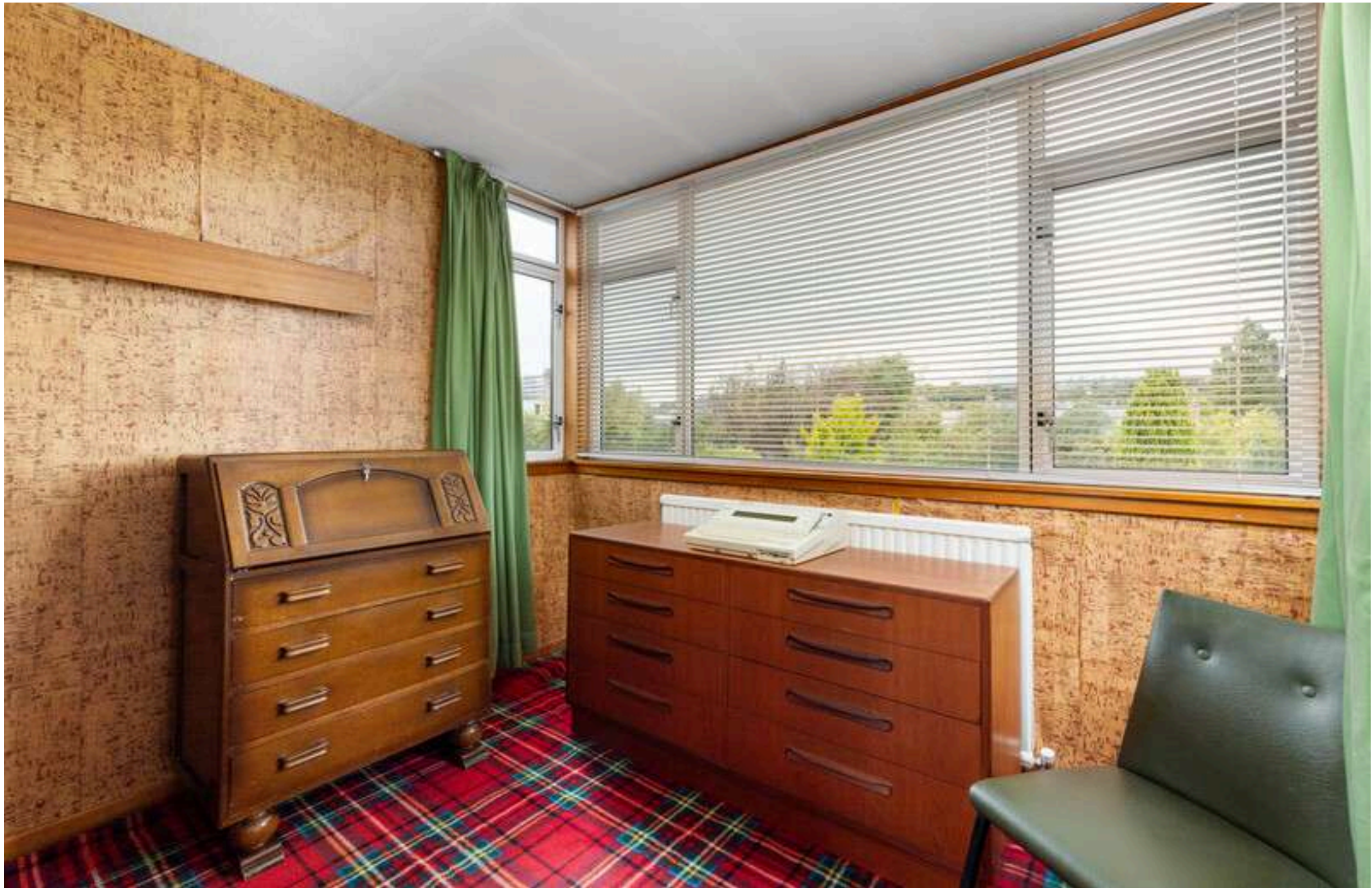
7 Baird Gardens, , Edinburgh, EH12 5RS