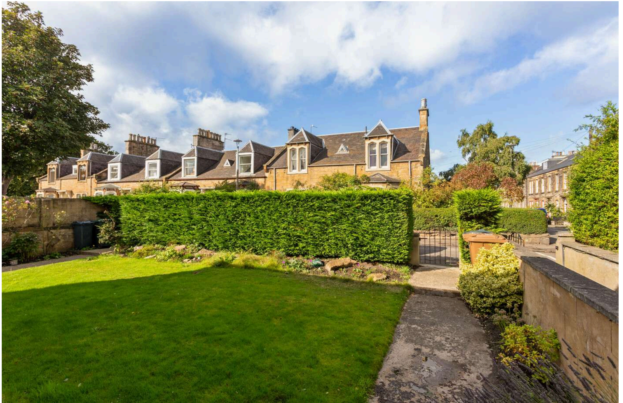
17 Rosefield Avenue, Portobello, Edinburgh, EH15 1AT