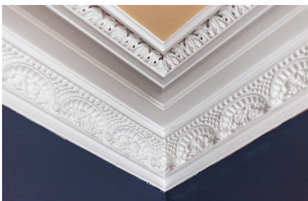
39 Morton Street, Joppa, Edinburgh, EHI5 2JA