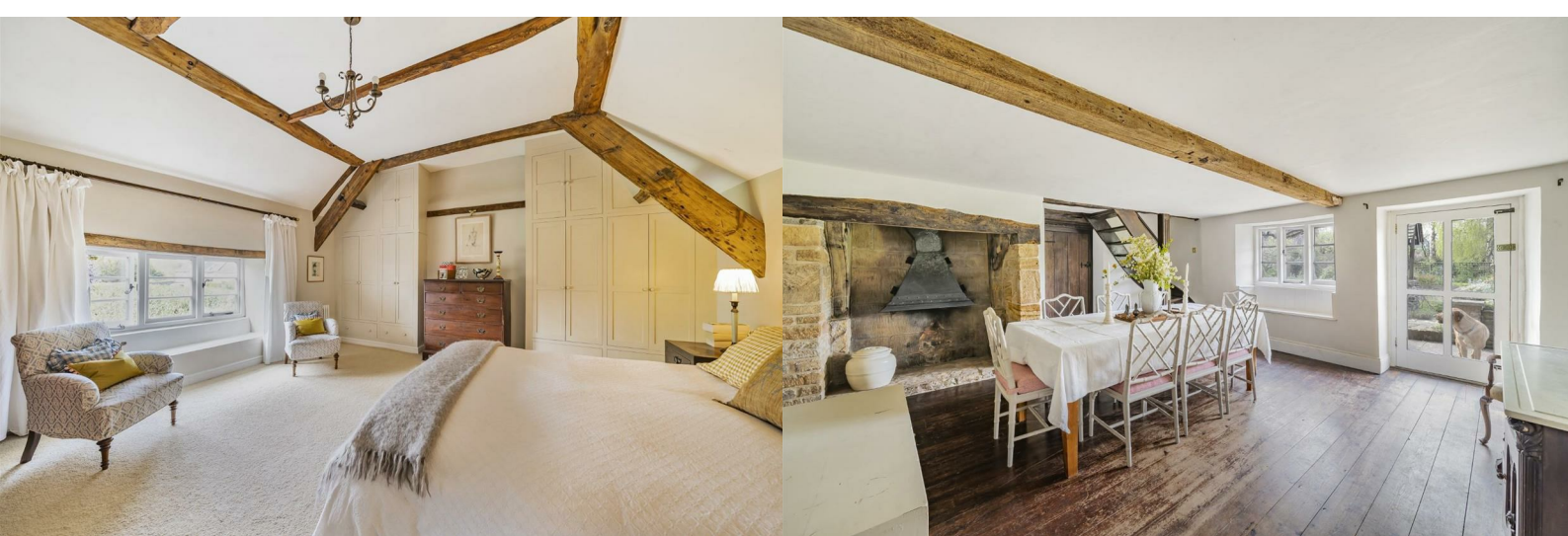
Council Tax: F