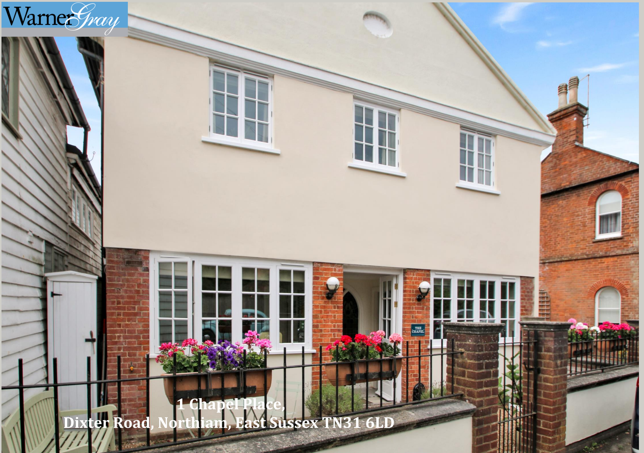
1 Chapel Place, Dexter Road, Northiam, East Sussex TN31 6LD