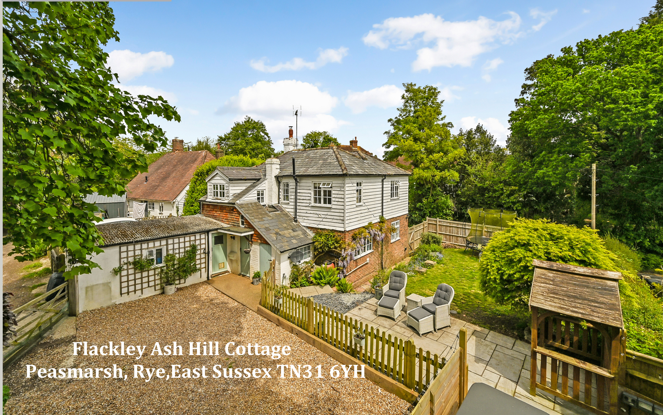
Flackley Ash Hill Cottage Peasmarsh, Rye, East Sussex TN31 6YH