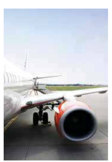
▲ 14 MILES