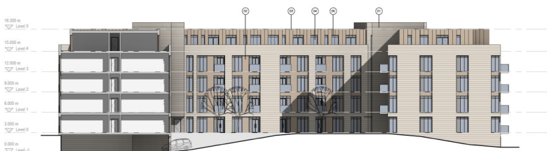
Building 5 (North Elevation)