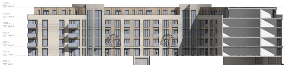
Building 5 (East Elevation)