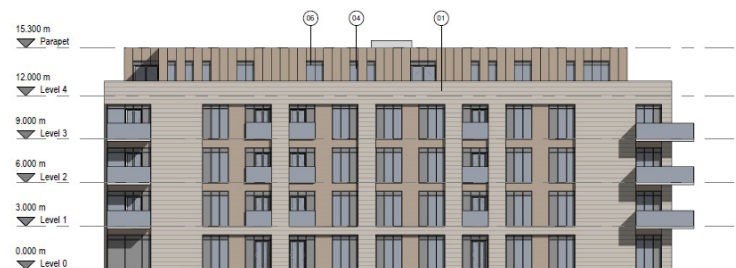
Building 4 (West Elevation)

Link to planning application drawings here