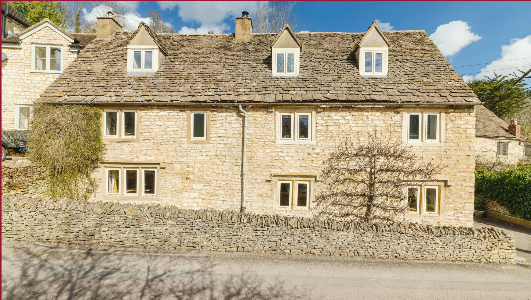
Lyndale, Downend, Horsley.

Lyndale, Downend, Horsley, Stroud, GL6 0PQ