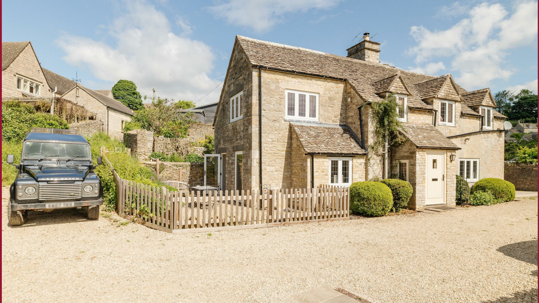
Oakridge Lynch, Stroud