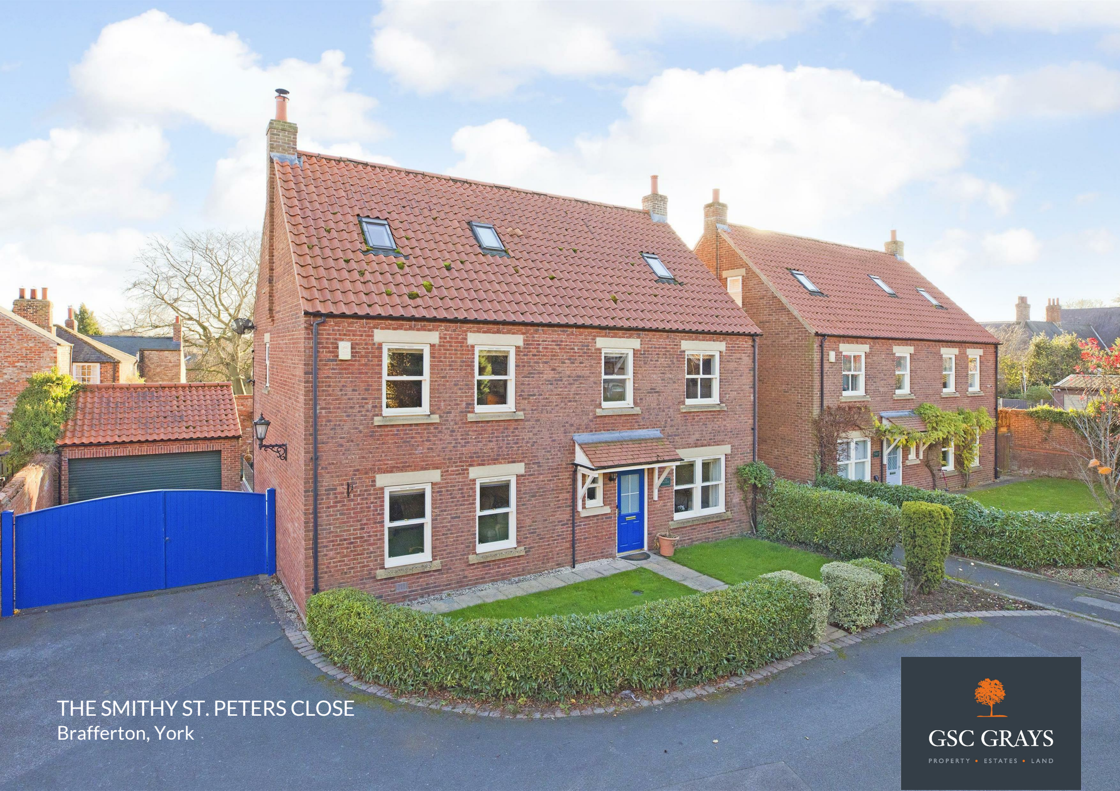
THE SMITHY ST. PETERS CLOSE Brafferton, York