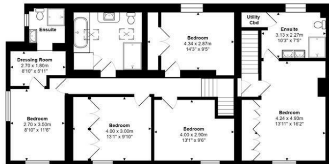
First Floor Area: 118.0 m 2 ... 1270 ft 2

Total Area: 306.3 m 2 ... 3297 ft 2 (Total Area of Annex: 112 sq. m ... 1205 sq. ft) All measurements are approximate and for display purposes only.