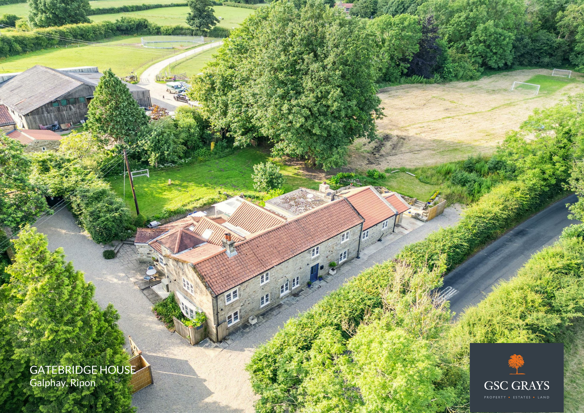
GATEBRIDGE HOUSE Galphay, Ripon