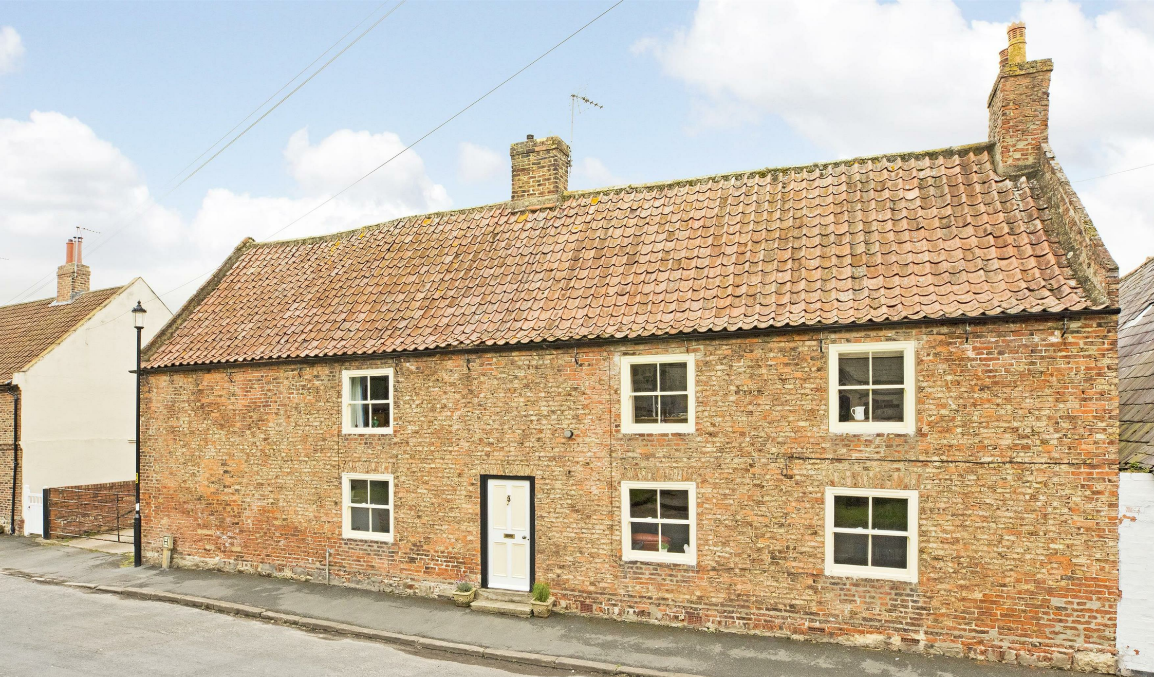
SUTTON FARM, ALDBOROUGH Aldbrough,