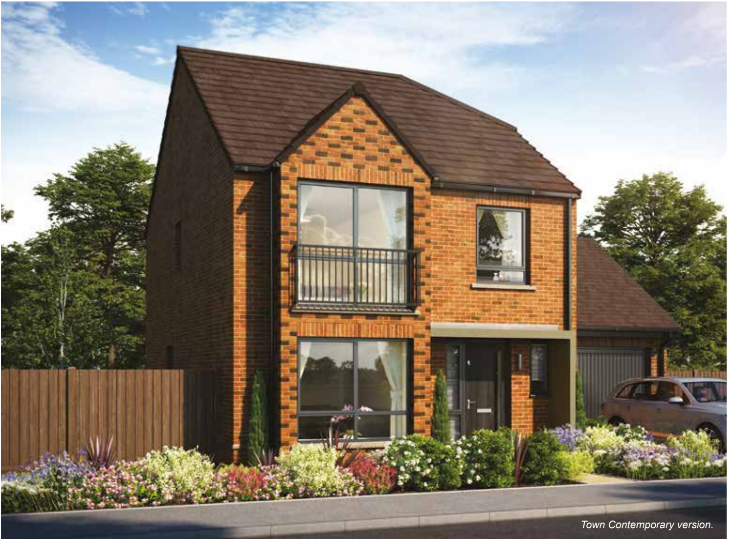
Town Contemporary version.