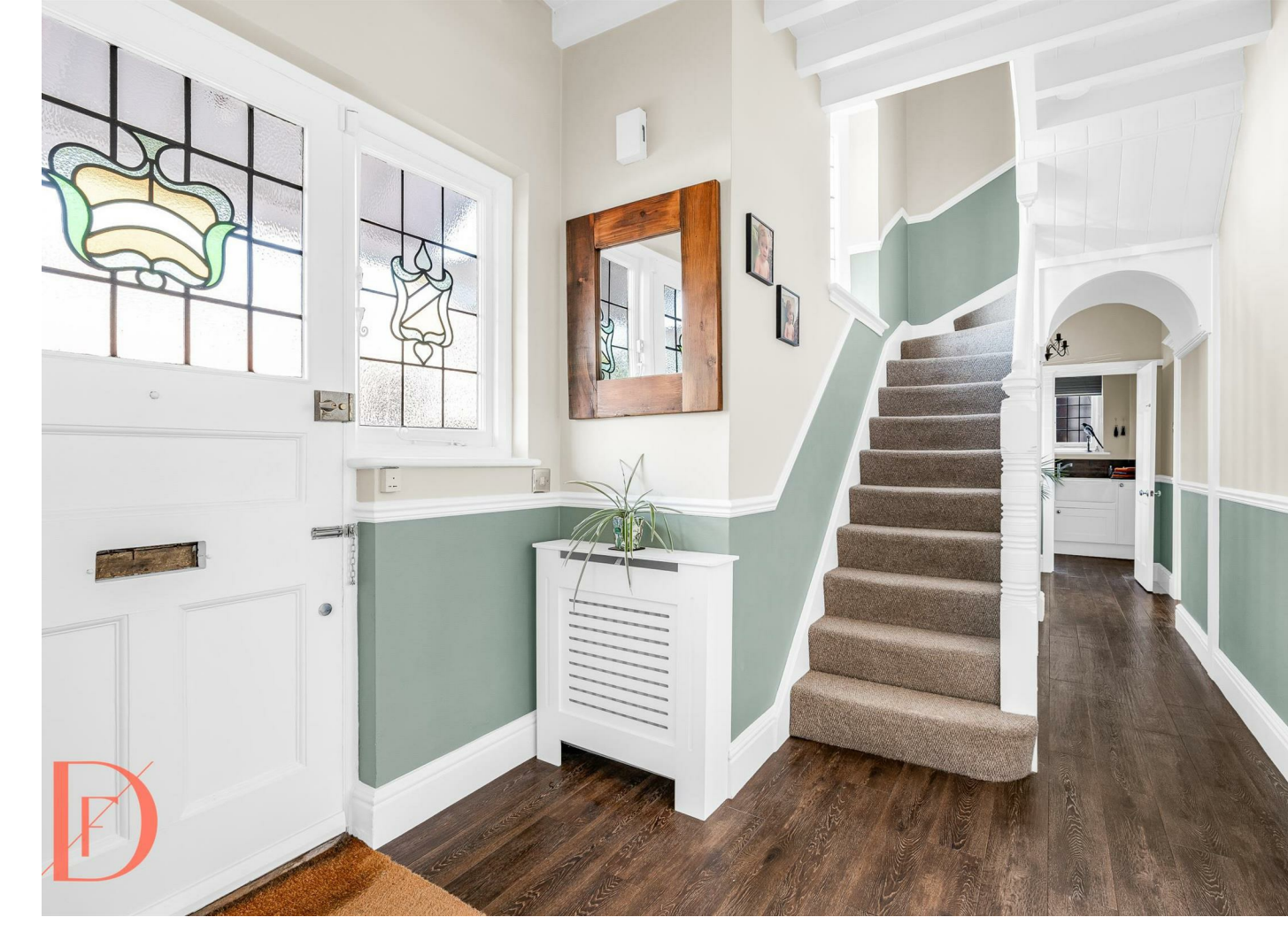
Tenure Freehold Council Epping Forest

Outside, the expansive garden is bordered by mature shrubs, with a generous lawn and a well-sized patio area, perfect for entertaining. The purpose-built office, complete with central heating, multiple electrical sockets, and broadband, offers flexible use as a home office, gym, or even a potential annex for a teenager or grandparent. At the rear of the garden, a large cabin/summer house with power and a TV aerial provides further versatility, with an adjacent shed for garden storage and to the front of the property there is off-street parking for up to five cars is easily accessible via a double dropped kerb.