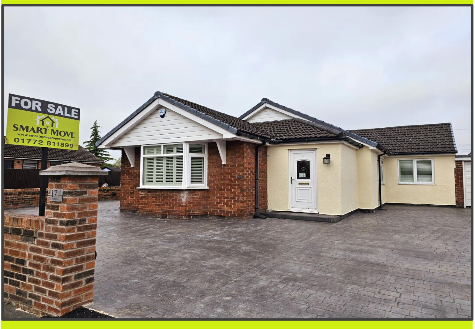
Asking Price £382,000