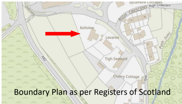
Boundary Plan as per Registers of Scotland

Viewing: Viewing strictly by appointment through the selling Agent.