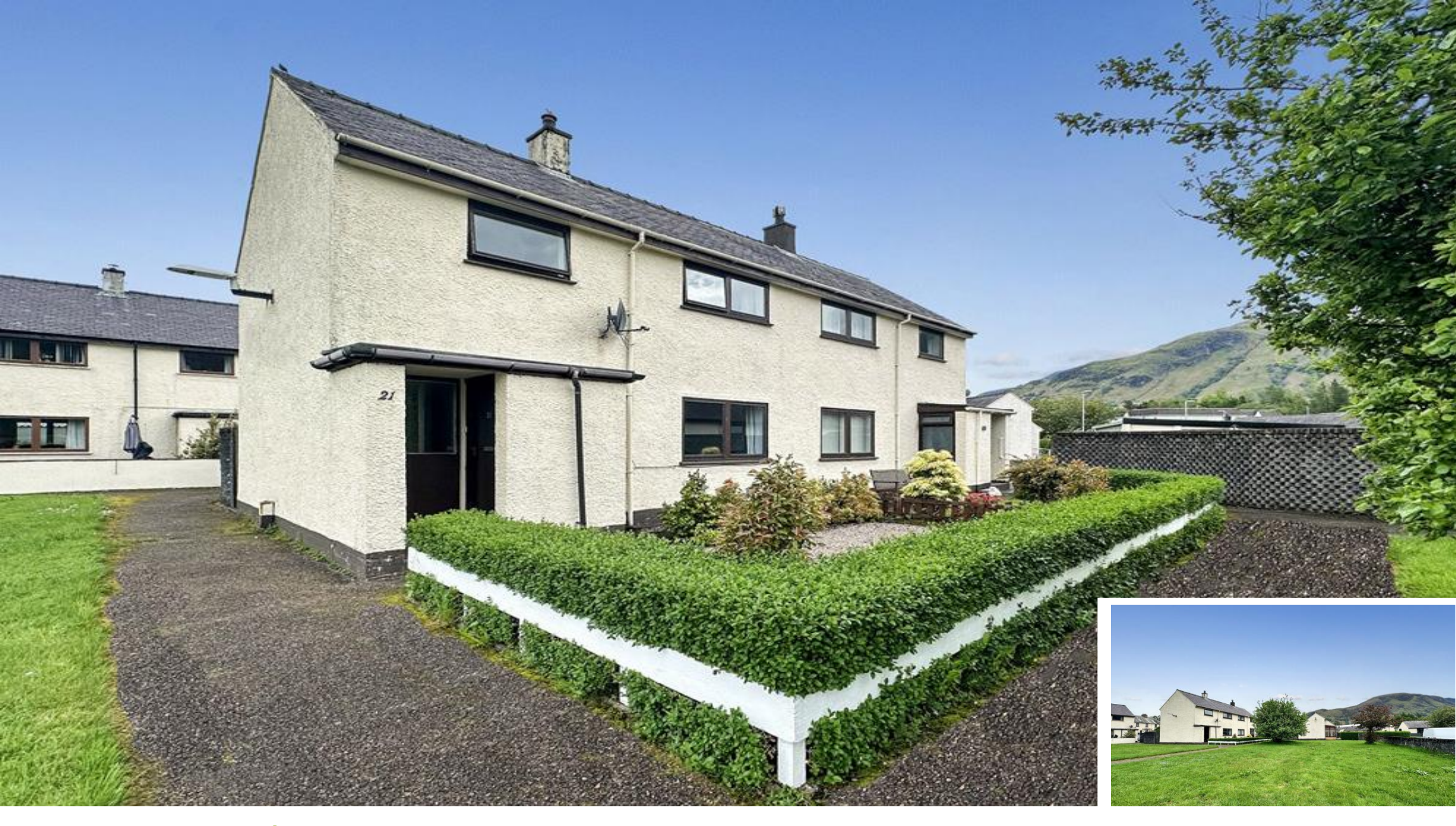
21 Nevis Road