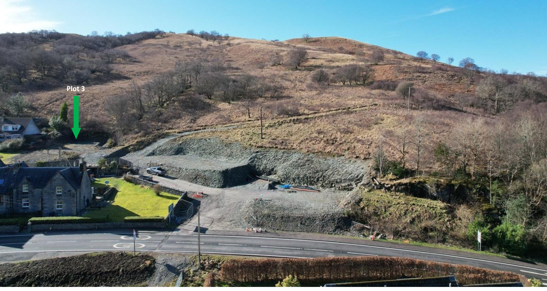
Plot 3, Tynribbie Hill