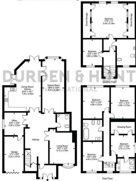
For Illustration Purposes Only - Not To Scale

Nelmes Crescent Approx. Total Internal Area 3450 Sq Ft - 320.47 Sq M (Including Eaves Storage, Restricted Height Area & Garage) Approx. Gross Internal Area 3168 Sq Ft - 294.36 Sq M (Excluding Eaves Storage, Restricted Height Area & Garage) Approx. Gross Internal Area Of Garage 164 Sq Ft - 15.19 Sq M