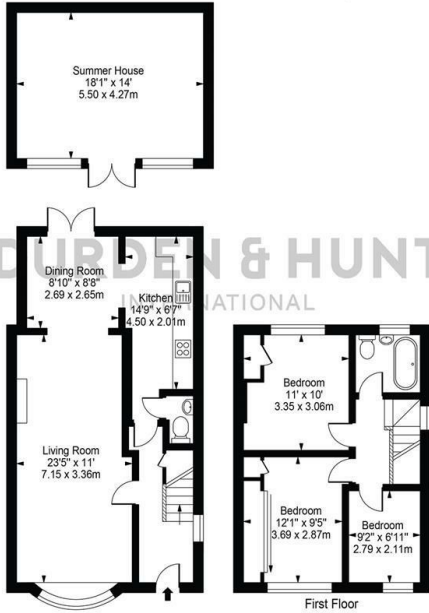
Ground Floor First Floor For Illustration Purposes Only - Not To Scale

Maybank Avenue Approx. Total Internal Area 1232 Sq Ft - 114.47 Sq M (Including Summer House) Approx. Gross Internal Area Of Summer House 253 Sq Ft - 23.49 Sq M