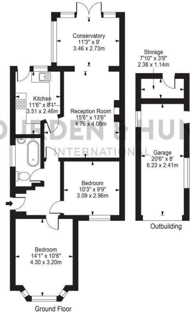
Ground Floor For Illustration Purposes Only - Not To Scale

Church Lane Approx. Total Internal Area 950 Sq Ft - 88.30 Sq M (including Outbuilding) Approx. Gross Internal Area Of Outbuilding 191 Sq Ft - 17.72 Sq M