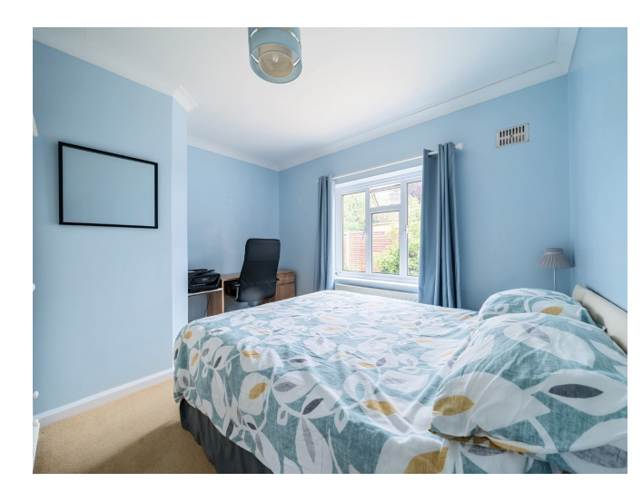
GENERAL REMARKS AND STIPULATIONS:

Tenure: The property is offered for sale freehold by private treaty with vacant possession on completion.