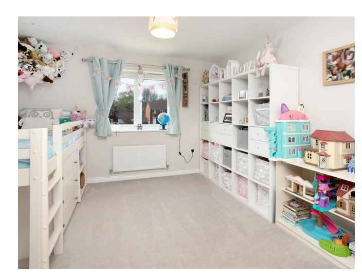
GENERAL REMARKS AND STIPULATIONS:

Tenure: The property is offered for sale freehold by private treaty with vacant possession on completion. Services: Mains water with meter, mains electricity, mains drainage, gas fired central heating.