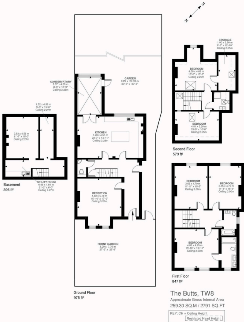
Illustration for identification purposes only. Not to scale.

Director 020 3488 6445 07738 401 822 paul@leslieandcompanyuk.com