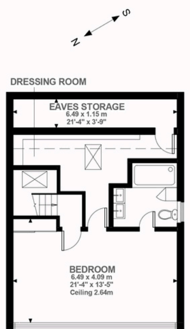
Second Floor 527 ft 2