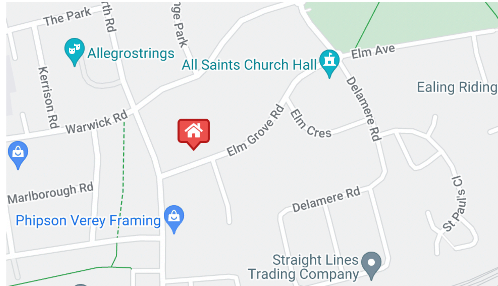
Illustration for identification purposes only. Not to scale.

Approximate Gross Internal Area 246.00 SQ.M / 2648 SQ.FT (INCLUDING EAVES STORAGE & GARAGE) EAVES STORAGE & GARAGE 24.44 SQ.M / 263 SQ.FT EXCLUSIVE TOTAL AREA 221.56 SQ.M / 2385 SQ.FT