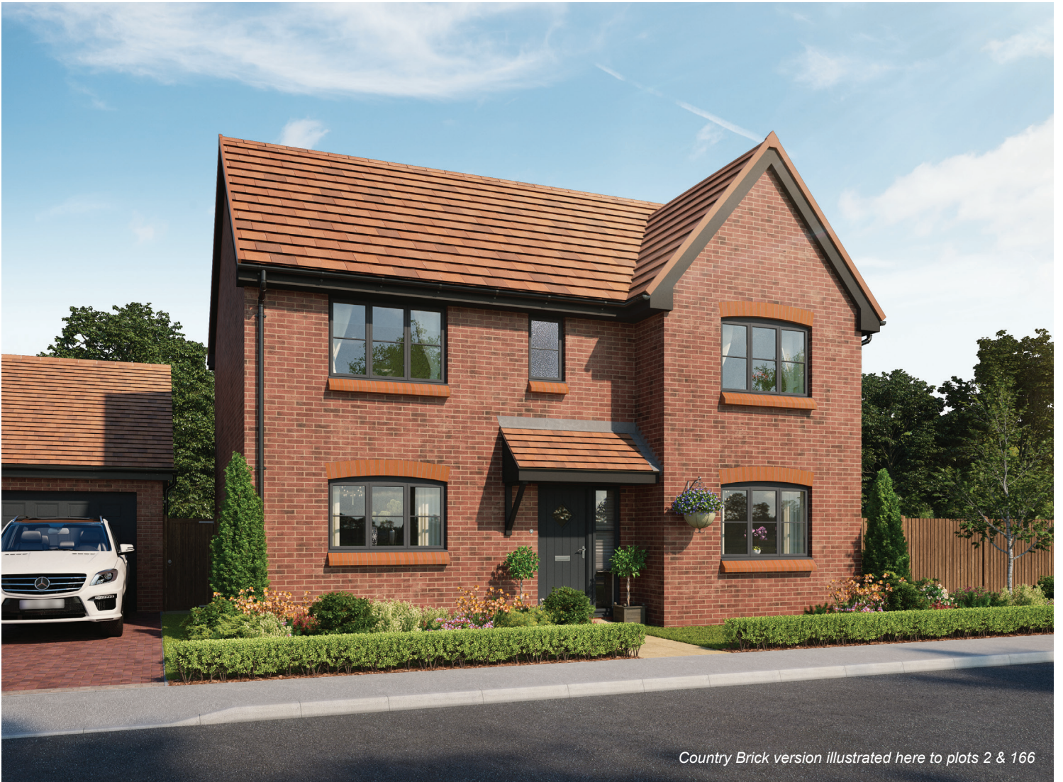
Country Brick version illustrated here to plots 2 & 166