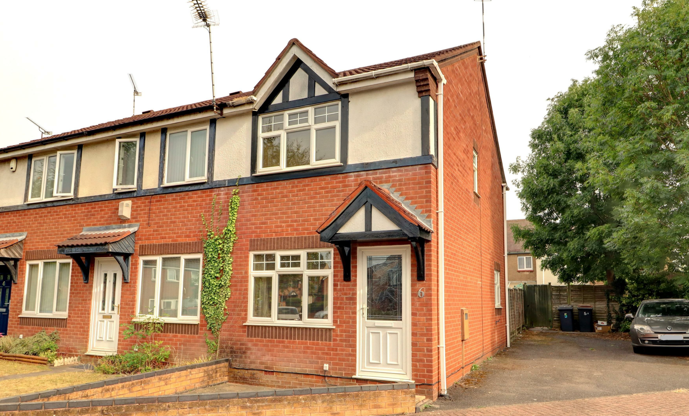
Rochester Close, Nuneaton, CV11 5XL