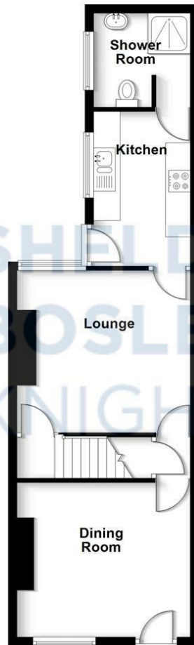
Ground Floor Approx. 46.8 sq. metres (503.7 sq. feet)