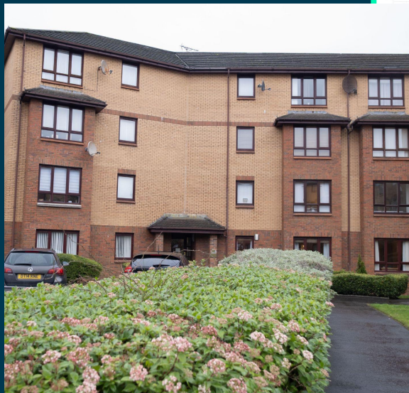
Millstream Court, Paisley, PA1