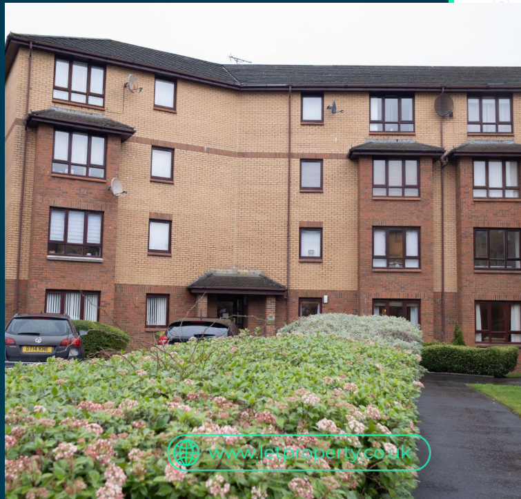
Millstream Court, Paisley, PA1